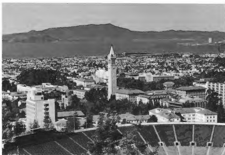
The Berkeley campus of the University of California, site of the 10th National Collegiate Judo Championships.